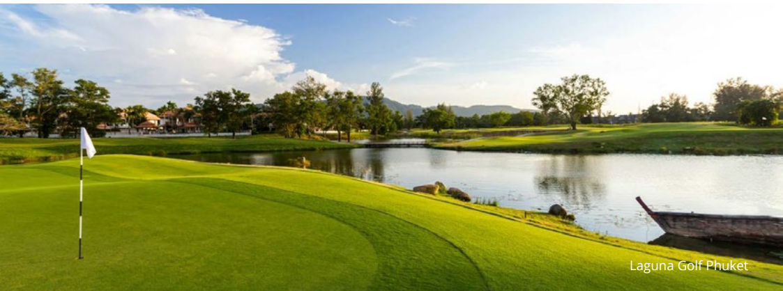
Laguna Golf Phuket

In addition to a choice of luxurious spas, five-star resorts, the 18-hole Laguna Phuket golf course, varied water sports and leisure activities within Laguna Phuket, owners are also well placed to make the most of lifestyle attractions nearby such as the Boat Avenue and Central Porto de Phuket retail and dining districts.