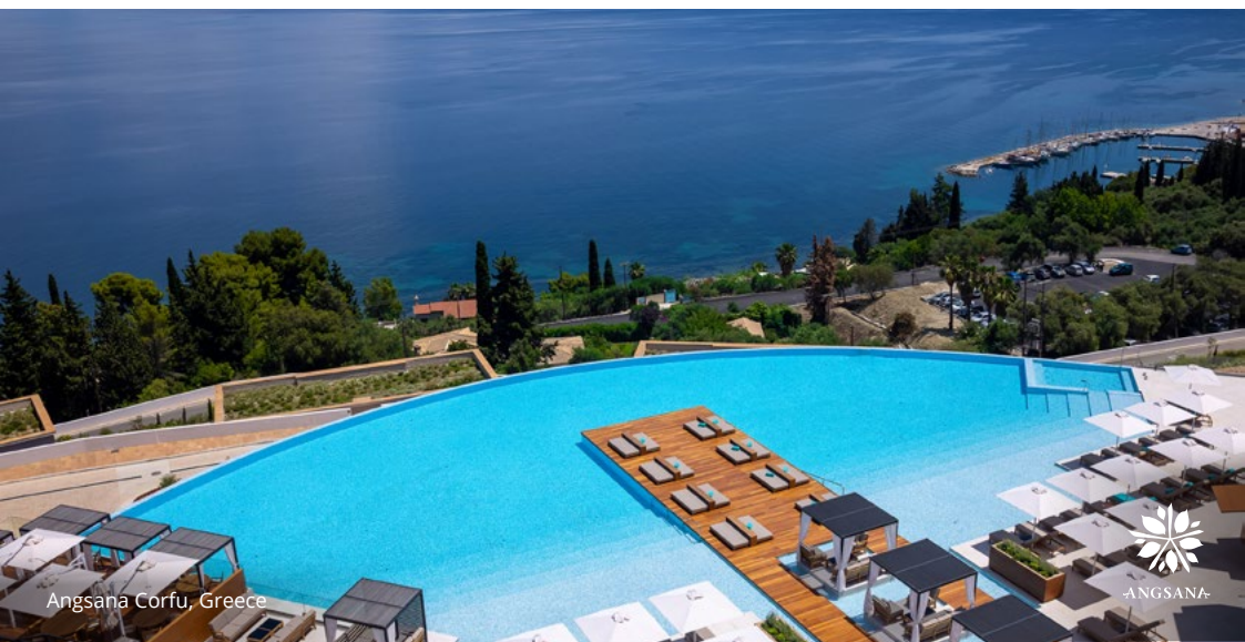
Angsana Corfu, Greece