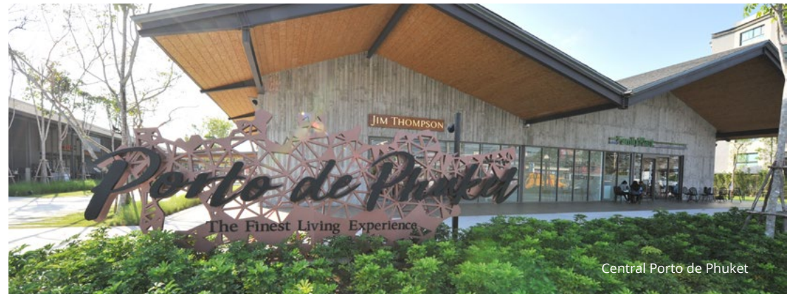
Central Porto de Phuket